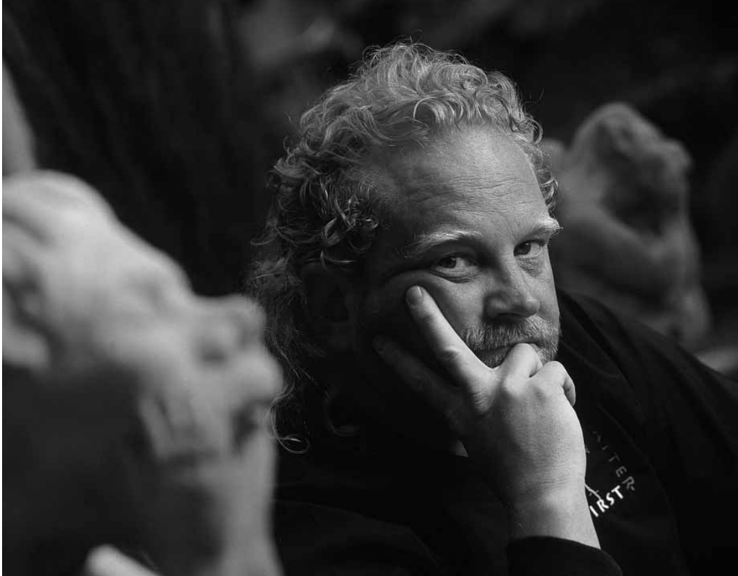
Watts Wacker: What the future looks like

→ cards when you assume the world is changing more and more rapidly.