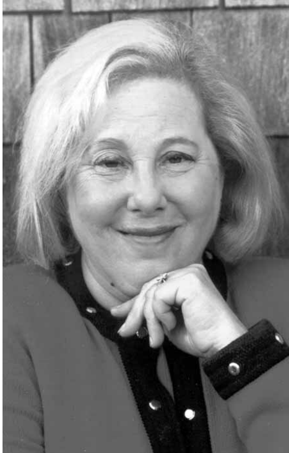
Rosabeth Moss Kanter: Confidence and citizenship

" Confidence was published so recently that I am still working on its applications and implications – such as tools to diagnose the culture of a business and identify a winning streak or losing streak in the making, or to analyse the elements of a culture for accountability, collaboration, and innovation. I